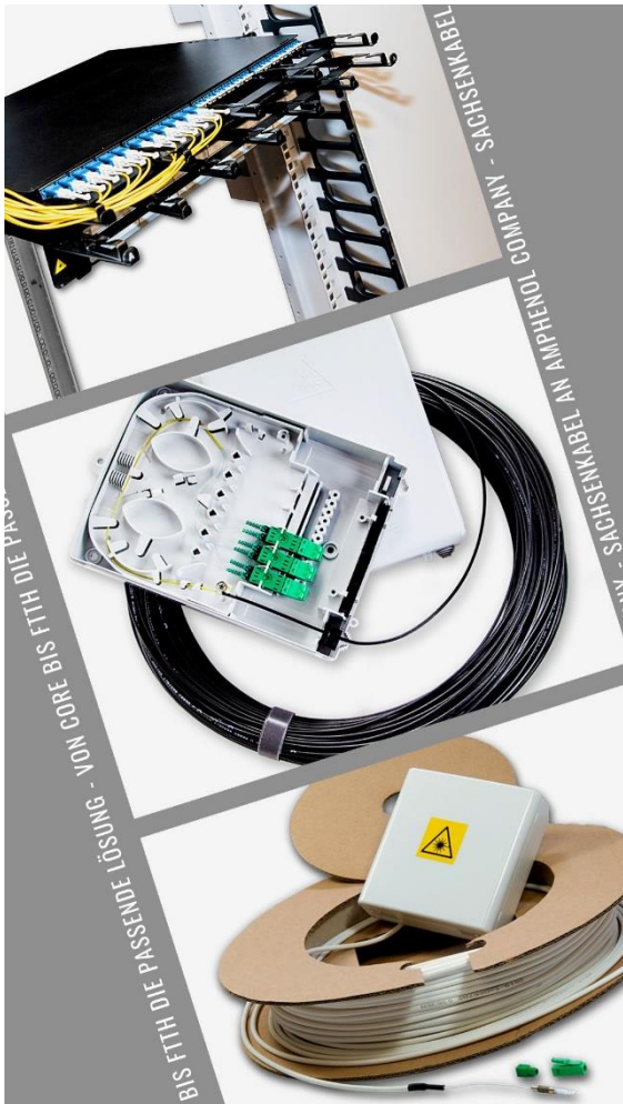
Image 2-6: LWL-Sachsenkabel GmbH shows the Spectrum of its Fiber Optic Solutions in the Field of telecommunications, data centers and buildings.