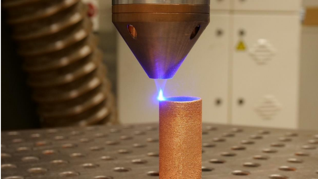
Figure 2: Additive manufacturing of a copper component using a blue diode laser.